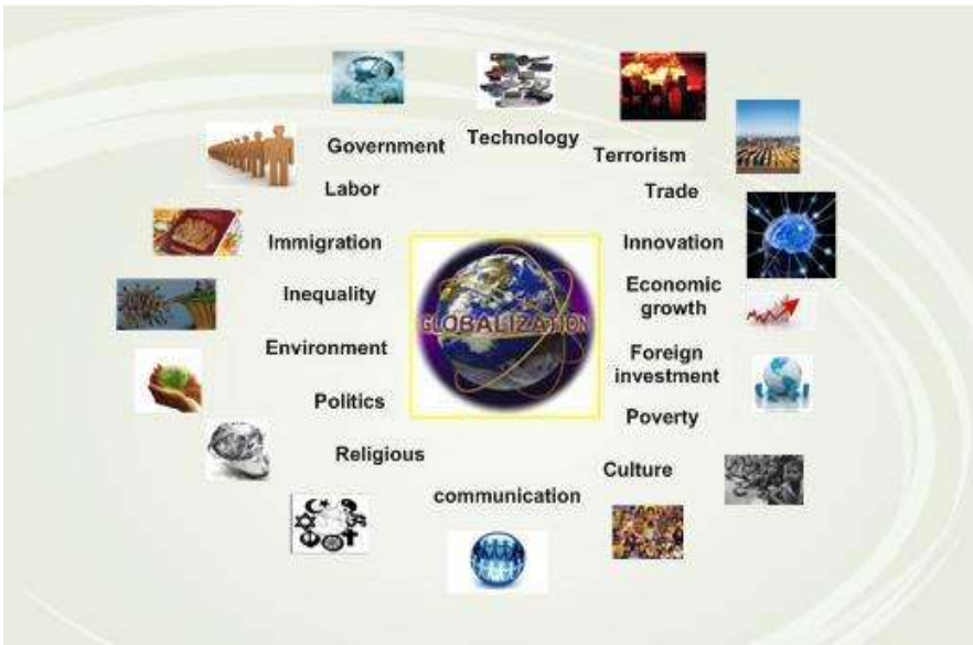
Figure 1: Various effects of globalization

Globalization is not a new phenomenon. Rather, our world has experienced it since many years ago [1-4]. Globalization is a complicated process, which affects different aspects of our lives such as economic, social, environmental and political sphere (Figure 1). Globalization includes flows of goods and services across borders, international capital flows, reduction in tariffs and trade barriers, immigration, cultural transformation, and the spread of technology and knowledge beyond borders.